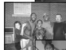
Family Fun Night - Water Games