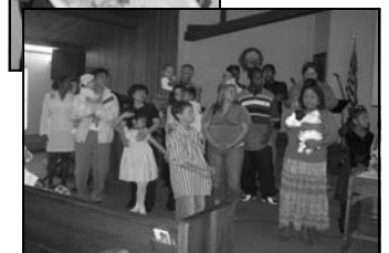
First Baby Dedications Mothers Day 5/14/06