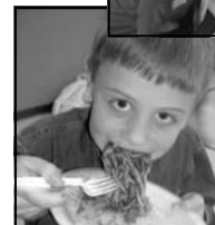
Food & Fellowship - Spaghetti Dinner